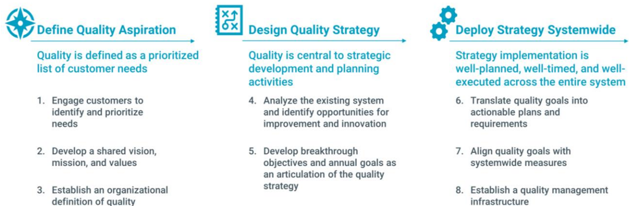
Figure 5. A Sequenced Approach to Quality Planning

The quality planning process shown in Figure 5 seeks to respond to each gap using a systematic and sequenced approach, with specific processes outlined for each phase of the QP process. The steps are intentionally numbered to follow the defined sequence.