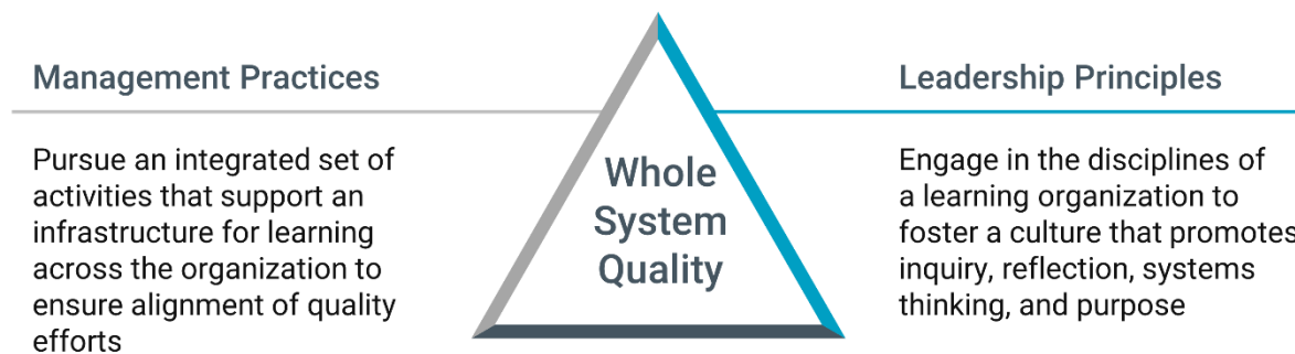
Figure 2. Whole System Quality Practices and Principles