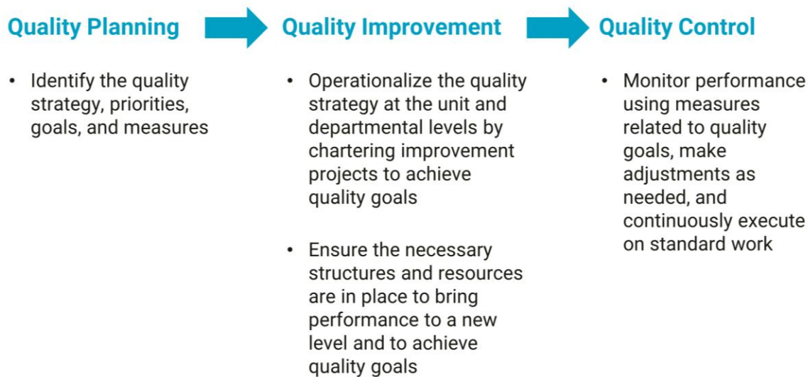
Figure 8. Relationship Between Quality Planning, Quality Improvement, and Quality Control

The specific structure of the quality improvement system in each organization may differ, but successful QI systems share similar elements as described below.