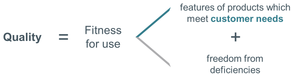
Figure 1. Juran’s Definition of Quality

Source: Juran JM, Godfrey AB. Juran’s Quality Handbook (5th edition) . McGraw-Hill; 1999.